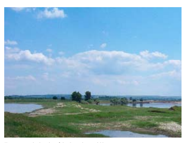
Tourism on the border of the Danube could be an opportunity for Garla Mare .

The citizens of Garla Mare view the development of tourism as a way to increase their income. As the mayor of Garla Mare stated, tourism can also be seen as the initial push needed for wider development since tourism goes hand in hand with regional development. Although he recognised that tourism in Garla Mare might foster a feeling of competition from other villages in the region, he saw