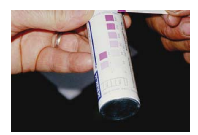
Example of a nitrate quick-test: this particular test showed that drinking water well had a very high level of nitrate

A survey was carried out by the M&S staff among 480 inhabitants about their knowledge and experience with the health effects from water pollution. It showed that there was hardly any awareness about the link between polluted water and health (e.g. a majority thought that if the water looked clean it should be clean—even though nitrates, bacteria and pesticides are not visible to the eye.). The survey also showed that the Garla Mare inhabitants believed that the water quality of a water-spring downhill