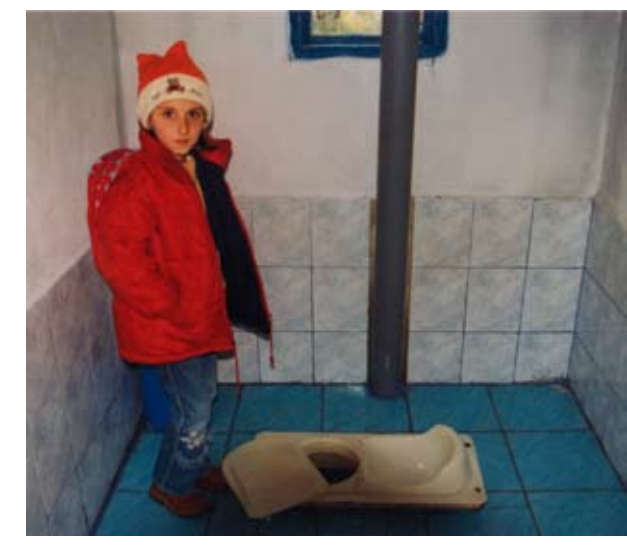
School girl shows the dry urine diverting toilet.

Ecological dry urine diverting toilets – also called ecological sanitation or Ecosan toilets - have three major advantages over flush toilets: they are inexpensive (8-10 dollars in local production for a low-cost model), require no connection to a sewage system, do not use (drinking)-water for flushing and avoid faecal material or urine from getting into the groundwater and polluting it. After proper treatment