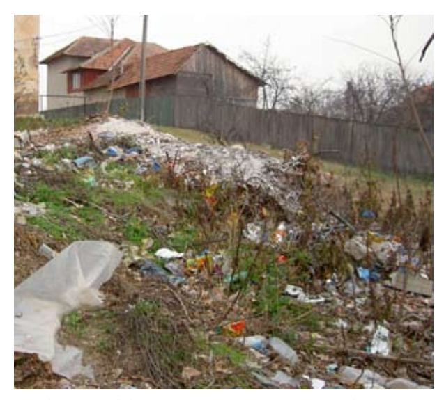
Developing a solid waste management system in Garla Mare is very necessary, currently citizen's dump their waste on the outskirts of the village.

In co-operation with GEOSAN, a student will do an investigation on solid waste management in Garla Mare to find out suitable and affordable options, barriers and existing regulations at the local, national and EU level.