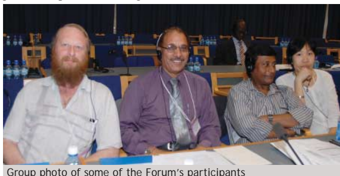
Group photo of some of the Forum's participants