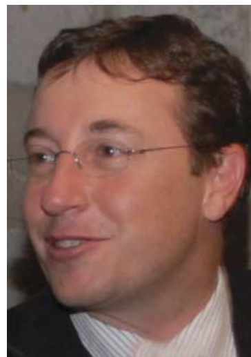
Achim Steiner, UNEP Executive Director

Steiner underscored the relevance of GC-24/GMEF convening against the backdrop of the unprecedented international interest in the recently released Intergovernmental