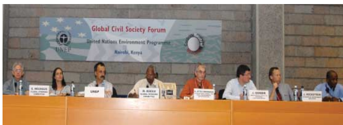
Panel members during the session on the Way Forward to Engage Major Groups in the Work of UNEP

In the ensuing discussion, participants addressed various issues, including the need for civil society to engage more with governments and for enhanced outreach to grassroots constituencies. They also debated the composition of the Global Steering Committee, calling for it to be more viable and representational. One participant suggested emulating the CSD process, which he described as transparent and participatory. Several participants reiterated that statements developed by individual major groups are more useful than a consensus Global Civil Society Statement.