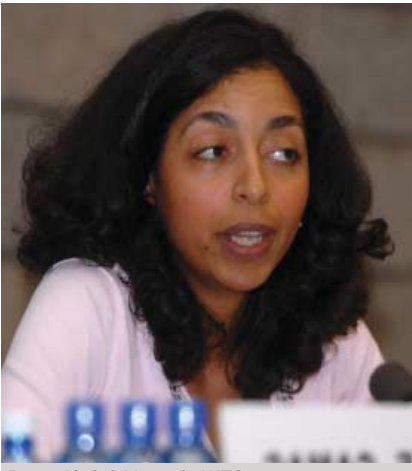
Doaa Abdel-Motaal, WTO

labor protection and rights and conflicts with International Labour Organization agreements.