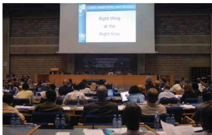
Participants during the dialogue session on Globalization, Ecosystem Services and Human Well-Being

In the ensuing discussion, participants called on the WTO to implement trade measures that are supportive of national as opposed to multinational interests. One participant suggested that the WTO rules should be subordinate to MEAs, while another raised the potential of trade rules undermining