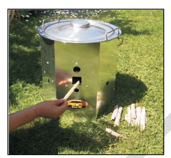
Efficient cook stove Save80

There are many examples of efficient stove projects in many parts of the world. Biomass supply for cooking and also heating represents a significant expenditure for many poor households; at the same time, unsustainably firewood harvesting leads to desertification and inefficient stoves cause respiratory diseases.