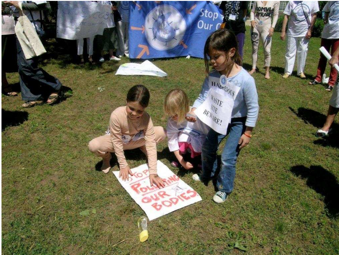
“Stop polluting our children’s bodies”. Creating a better health and environmental protection for children. Protest by parents and Children during the Children’s Environment and Health Plan for Europe Conference in Hungary

use of inferior fuels for cooking and space heating in developing countries. The following sections will explore them in some detail.