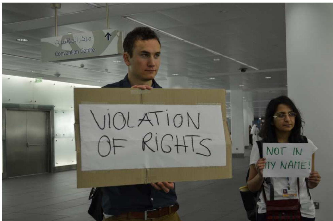
Participants in an action led by Women and Gender NGOs at COP18 in Doha, Qatar, decrying the lack of sincere and effective actions on the part of the countries from the Global North.

Furthermore, current mitigation strategies are often based on market or payment-related mechanisms which lack a gender or long-term social justice perspective. For example, the current promotion and use of biofuels has been taken forward without gender and environmental analyses that might have predicted their high social cost when they compete with food crops or are grown for industrial uses that do not contribute to development of the local community; and that their production can be just as bad for the climate when full lifecycle emissions are taken into account. Other mitigation strategies that prioritize carbon sequestration may also affect the relationship between women, especially indigenous women, and the forest, especially if access to traditional territories is restricted or banned for conservation purposes. 167 Many such strategies fail to prioritize local community benefits or consider the implications for women in terms of unequal land tenure rights. Ultimately they are likely to reduce access to forest resources, include water, food, fuel and other resources necessary for sustainable livelihoods.