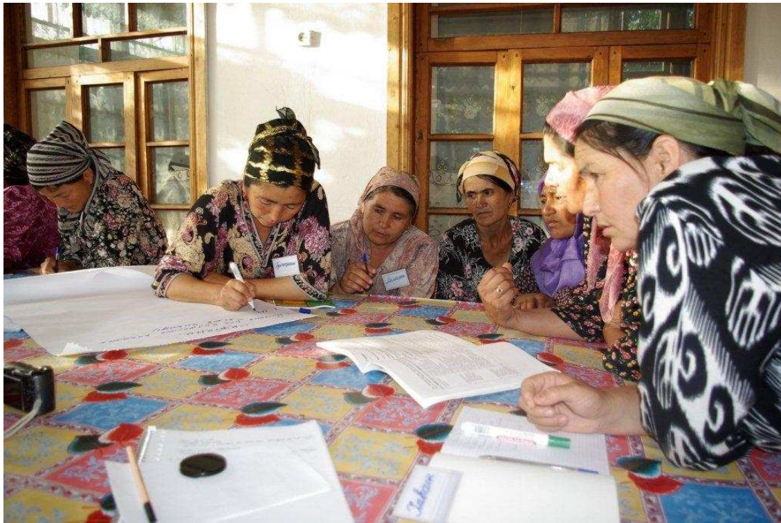
Participatory hygiene training enabling poor rural women to attain a sustainable livelihood by showing them ways of improving their living health conditions.

The Women's Major Group (WMG) is organized globally with over 390 representatives of non-governmental organizations. Two organizing partners (Women International for a Common Future, WICF, and Development Alternatives with Women for a New Era, DAWN) and two core group members (Women's Environment and Development Organization, WEDO, and Global Forest Coalition, GFC) coordinate the WMG 1 .