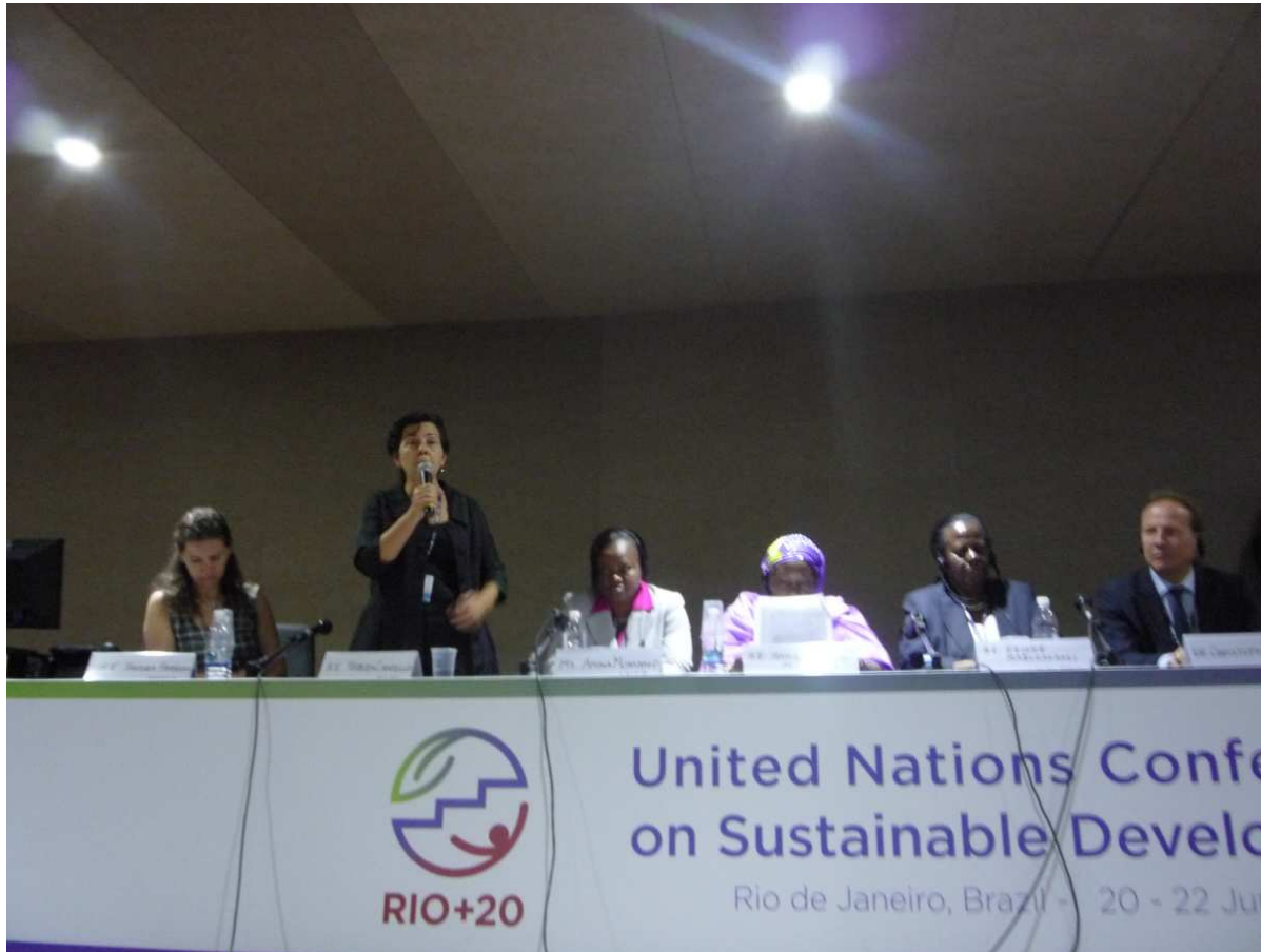
United Nations Conference on Sustainable Development, Brazil.