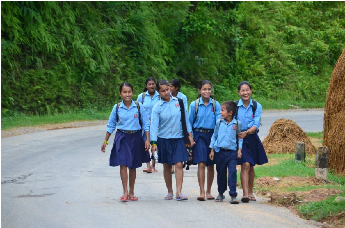
Children from Gorkha Community Forests, Nepal.

Such actions would bring about positive outcomes that are important for women and communities at large. Because of socialized gender roles and inequalities women are often not ensured of their rights, are burdened with care work in addition to any other productive or reproductive work, suffer gender-based discrimination in different spheres and levels, and experience sexual and physical violence. However, complex systems of inequalities and multiple discriminations based on race, ethnicity, class, geography and ability impact on all people's experiences. A gender equality and human rights lens will foster action that addresses these intersecting inequalities.