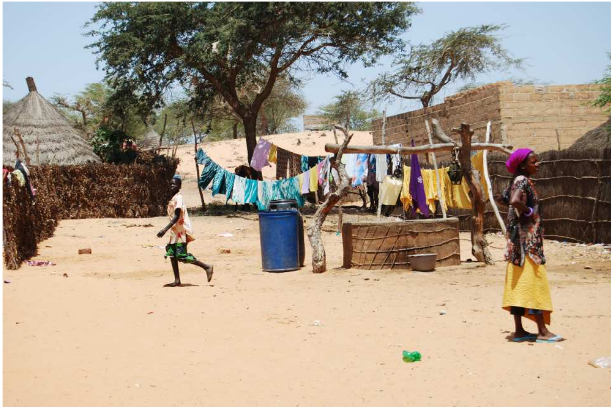
Recognise ecological limits to the 'growth' paradigm. Senegal.

This chapter is therefore merely catalytic in nature, taking an urgent discussion forward in at least two ways: Firstly highlighting how some feminist and women's groups, civil society movements and south states are tackling conceptual, technical and political concerns, strategies and recommendations related to extractivism; Secondly, raising questions on how to advance long-fought gender equality and universal human rights, social and economic justice in this necessary but often cooptive global focus on economic and ecological sustainability.