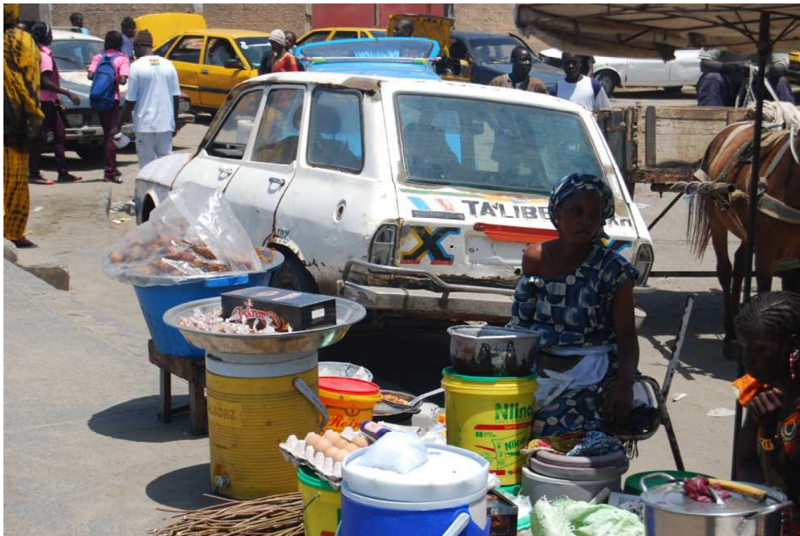
Saint Louis, Senegal.

It is clear that a full liberalisation of the agriculture sector through multiple mechanisms will reduce protection for women farmers and workers in developing countries. In addition, protective mechanisms such as sensitive products (using a gender criterion) and SSMs are being increasingly restricted. Women will also be hurt more as we liberalise investment, services, IP and public procurement. Their dependence on the resources threatened under these agreements is higher and their ability to shift out of agriculture is limited. Their role as food providers gets severely undermined not only by losses in production and livelihoods, but also from threats to natural resources, markets and technologies which are important for direct access to food as well as instruments for sustaining production and sales. Gender sensitivities need to be taken into account in all aspects of trade agreements, while combining it with gender friendly development policies.