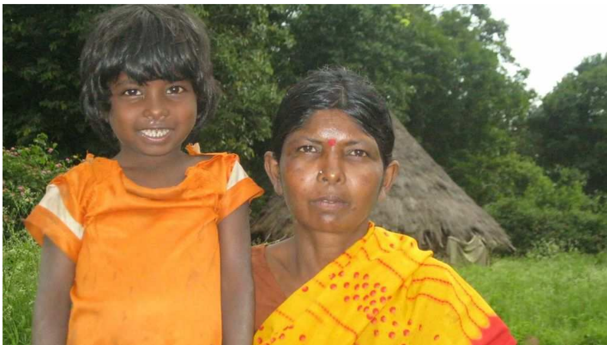
Chenchu mother and daughter, Andhra Pradesh, India.

The third issue to be addressed is the paradox of systematic undervaluation of care and discrimination against those who provide care in economic systems that rely heavily on unpaid work provided mainly by women. Not only does such unpaid work sustain and reproduce the labour force through its nourishment and care, but it also absorbs the 'invisible' costs of poor infrastructure and service provision when governments are unable to provide them. Such costs are manifested for example in the time devoted (mostly by women and girls) to fetch water or collect wood or other sources of fuel in rural and poor urban areas where services are not provided. Effects of climate change, ecological damage and extreme weather conditions further exacerbate such tasks. The dimensions of the unpaid economy should not be underestimated, as an increasing number of household satellite accounts continue to prove that it is comparable to the main economic sectors for most societies. 240