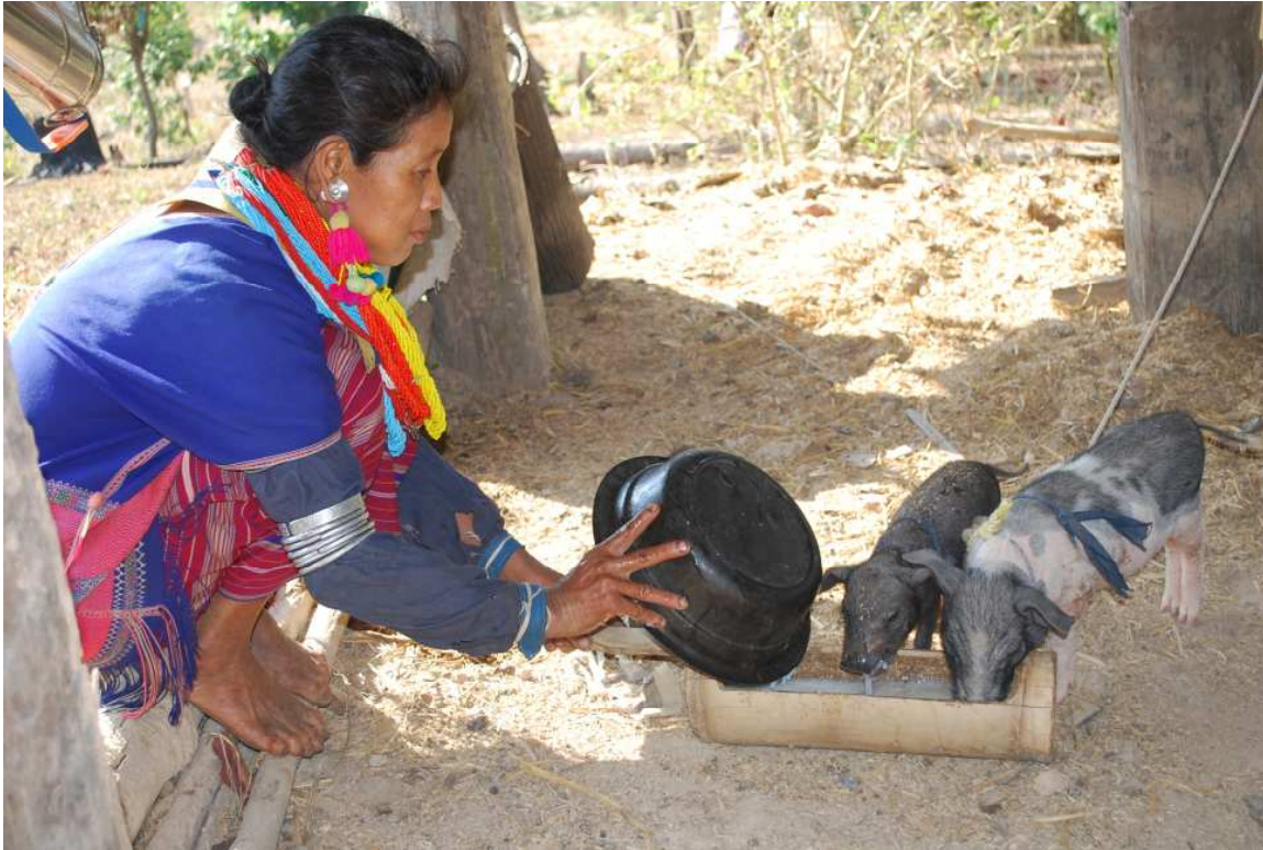
Thai daily life. Feeding the animals. Thailand. Photo: Indigenous Peoples Biocultural Climate Change Initiative. See http://ipcca.info