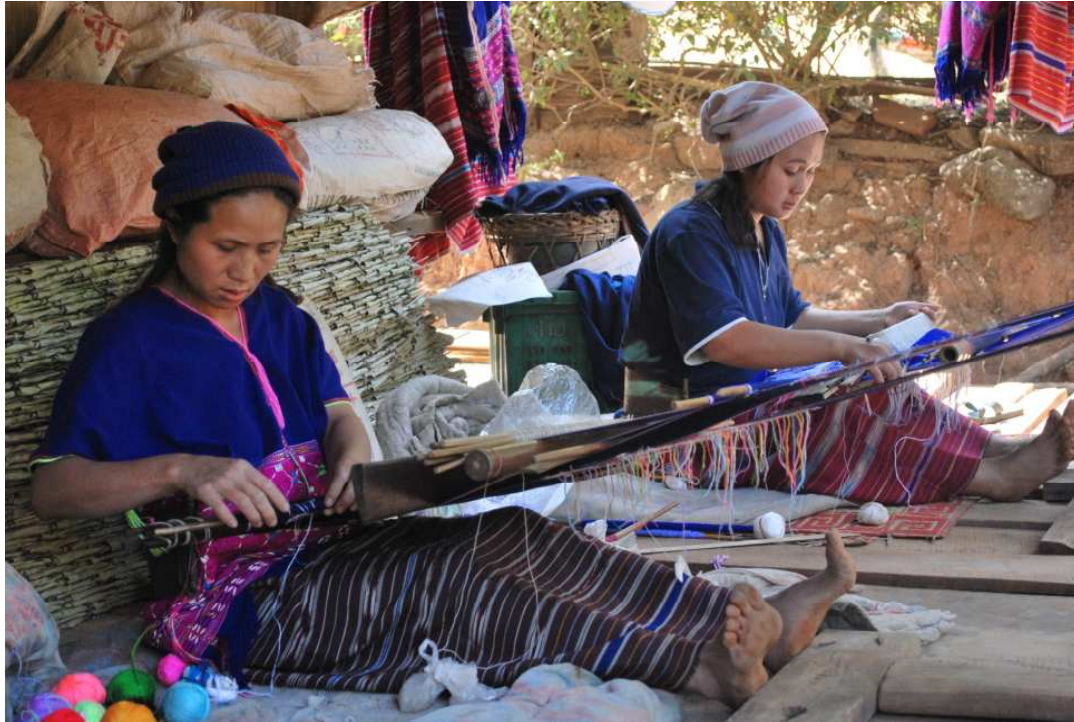
Traditional cloth weaving, Thailand. Photo: Indigenous Peoples' Biocultural Climate Change Assessment Initiative. See http://ipcca.info .

The SPF-Initiative is both fair and feasible. ILO studies show that it is globally affordable at virtually any level of economic development, even if less developed countries need international support to implement it gradually. 226 For example, El Salvador, Benin, Mozambique and Vietnam could provide a major social protection floor for as little as 1-2% of their Gross Domestic Product (GDP); and Burkina Faso, Ethiopia, Kenya, Nepal, Senegal and Tanzania could provide a universal basic pension for just over 1% of their GDP. In Brazil, the conditional cash transfer 'Bolsa Familia' already covers 46 million people, at a cost just 0.4% of its GDP. 227