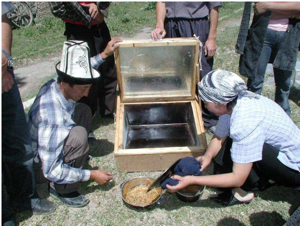
Demonstrating affordable and sustainable ways towards improved living conditions in rural areas of Kyrgyzstan, Photo: WECF/WICF