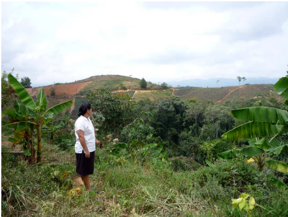
Woman from an agroecology farm in Lebrija-Santander, an area heavily affected by pineapple monocultures, where the community, including women's groups, have gathered together to restore the ecosystem by using traditional practices and using environmentally friendly techniques. Colombia.