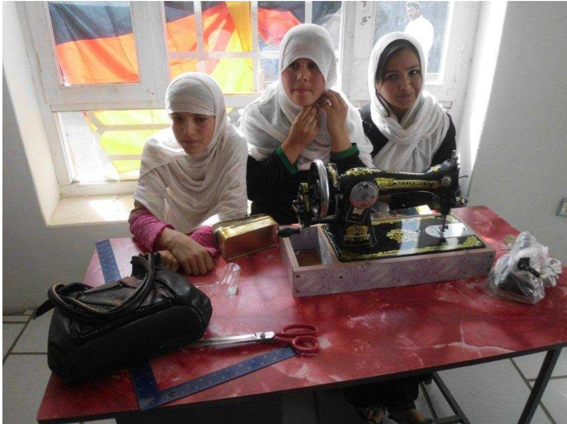
WECF partner Katachel prepares women and families in Kunduz for the winter by organizing a sewing project in Kunduz, Afghanistan.

As mentioned above, gender discrimination in social and economic roles also exacerbates women's environmental vulnerability. Women are at a higher risk from and are disproportionately affected by climate change and environmental degradation, because they have access to fewer resources — including land, credit, agricultural inputs, technology and training services, and participation in decision-making bodies — and this impedes their ability to avoid or adapt to various situations. 214 The lack of basic social protection increases women's dependency on natural resources and decreases the likelihood that they can overcome environmental distress.