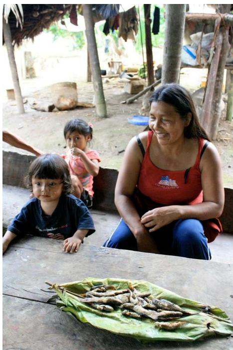
Sapara woman, Ecuador. Photo: Indigenous Peoples Biocultural Climate Change Initiative. See http://ipcca.info

Women's rights have been severely curtailed by the industrialisation of agriculture. The Green Revolution of the 1960s exposed small and landless farmers across the South, especially in Asia, to a wide range of negative social and ecological conditions, and compounded the exploitation experienced by women under existing feudal and patriarchal systems. Subsequent trade liberalization policies imposed on developing countries have exacerbated the situation, putting small and landless farmers, especially women farmers, at risk in multiple ways. The current economic, ecological and food crises are now pushing women and their families to the limit, with the starkest impacts being felt by the poorest, hungriest households.