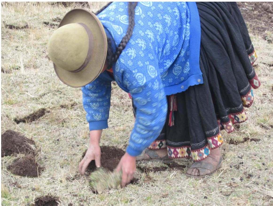
Female farmers in the ANDES. See also http://ipcca.info

According to ILO, the Decent Work Agenda should have four strategic objectives, with gender equality as a cross-cutting objective. These objectives are: creating jobs (generating opportunities for investment, entrepreneurship, skills development, job creation and sustainable livelihoods); guaranteeing rights at work (including workers' representation and participation); extending social protection (guaranteeing a minimum living wage, safe working conditions, and essential social security to all in need) and promoting social dialogue (through workers' and employers' organizations' effective participation). 255