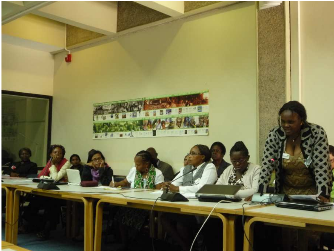
Gender Forum held in Nairobi in the context of UNEP's General Council, February 2013.

emerging technologies, must be actively involved in technology assessment processes, as well as indigenous and local communities, which are generally the least prepared to deal with the unforeseen consequences of technologies and are virtually never consulted in the technology development process.