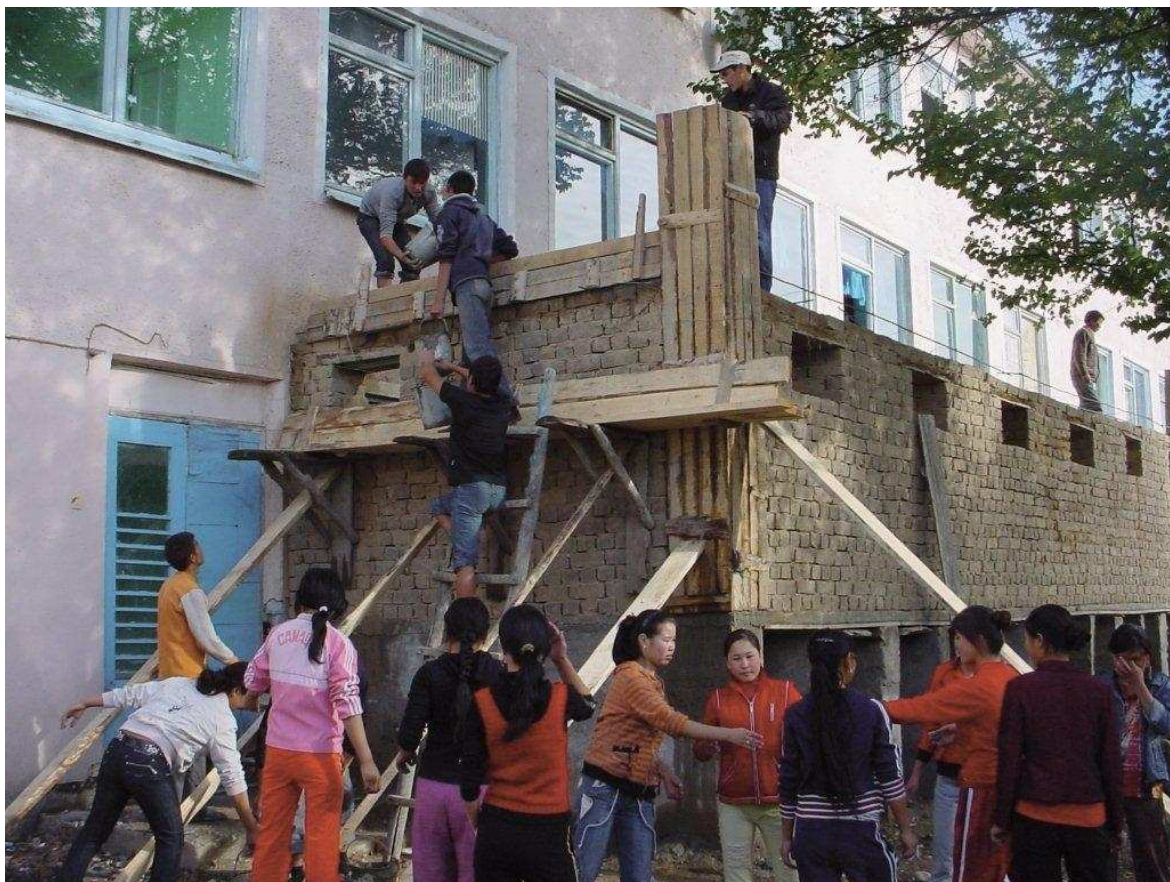
Women implementing energy saving measures at a school in Kyrgyzstan, by building solar collectors and training on sustainable insulation methods.

When asked, most people don't want to put their money into activities which kill other people, or which destroy their own health or environment. Nevertheless, almost all of us do. When analysing the investments of the major retirement funds, these funds invest in companies that are directly linked to undesirable products and processes, such as the tobacco industry, oil, gas, mining, uranium, pesticides and even arms. The investment and banking sector is probably the main driver for unsustainable development and indirectly, human rights abuse. At the same time, financial speculation with commodity prices has increased the number of hungry people in the world 32 . The extractive industry sector and the chemical industry sector have made their greatest profits ever last year, in the middle of the financial crisis, with the largest corporations making 30-50 billion profits per company in one year, even though they are responsible for among the greatest environmental harm in the world, - and in most cases they are not paying for the damage and clean-up. Clearly our financial system is a barrier to a sustainable and equitable economic system. Governments need to re-regulate corporations and the banks, going well beyond the first steps taken by the EU on bankers' bonuses.