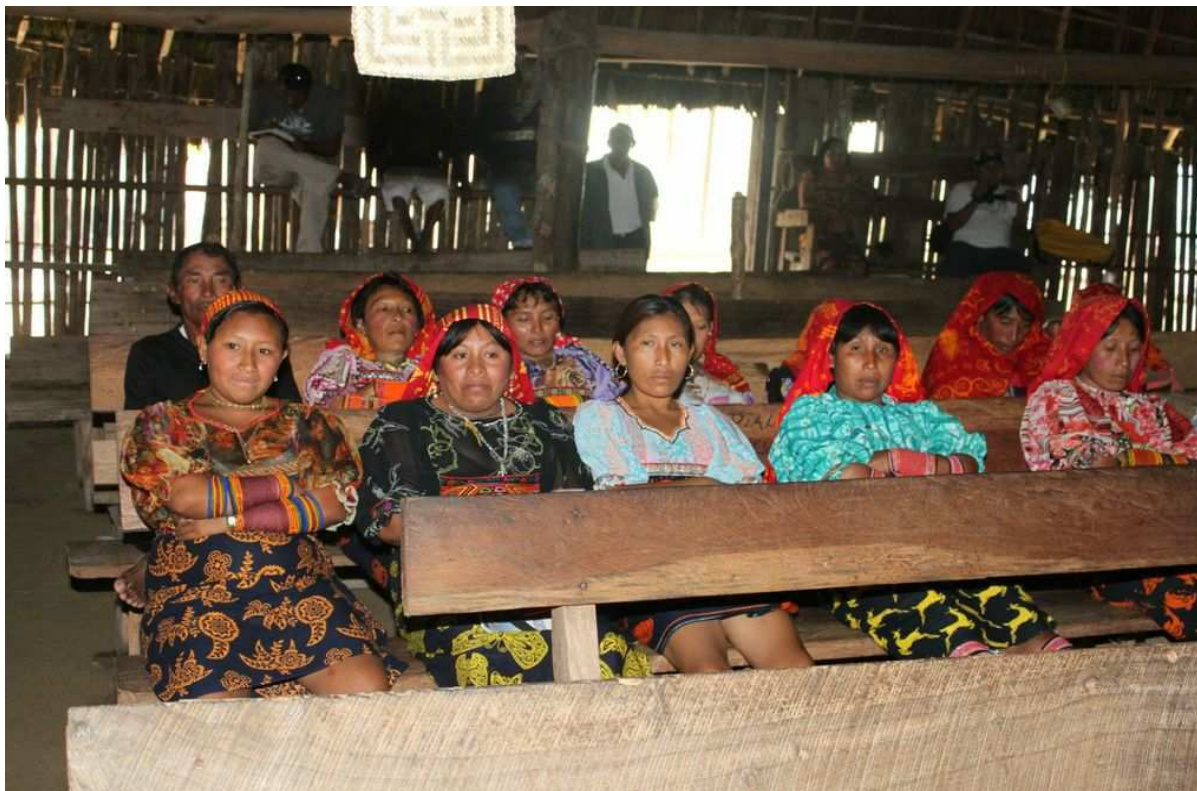
Kuna Yala women involved in decision-making process, Panama.