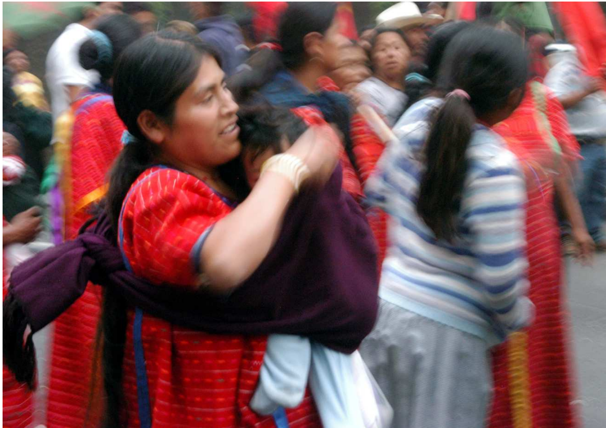
Indigenous people in Mexico city.

development agenda . 292 They also stated that all development proposals must be based firmly on non-regression and recognition of universally agreed human rights articulated through already agreed international law and agreements - not on notions of 'basic rights' and 'safety' that are hard to define and measure. 293