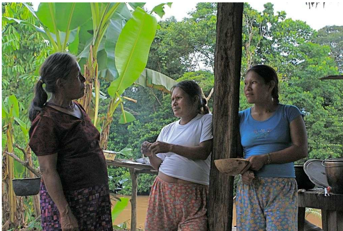
Sapara women, Ecuador. Photo: Indigenous Peoples Biocultural Climate Change Initiative. See http://ipcca.info

Women are preservers of seeds, of traditional systems of cultivation, of biodiversity as they depend more on these traditional systems and also help to nurture their diversity. These are under threat from the current IPR systems. Even the way traditional knowledge is currently being 'protected' by the mainstream approach actually either takes access away from communities, or lures them into the IPR system in the name of rights, reward or recognition. The IPR system is inadequate to deal with people's knowledge systems, which neither privatised the knowledge nor were based on individual inventorship. For most local groups and women their know-how of the living world is intellectual heritage and not intellectual property. Despite what is said globally and nationally about patents, plant variety protection, geographical indications, etc. mere accommodating women within them does not effect real justice to them. For example, the relation of India's Biological Diversity Act with these IPR laws has to be critically viewed, as this conservation law is also fast becoming a venue to approve IPR applications on India's biological resources and related knowledge.