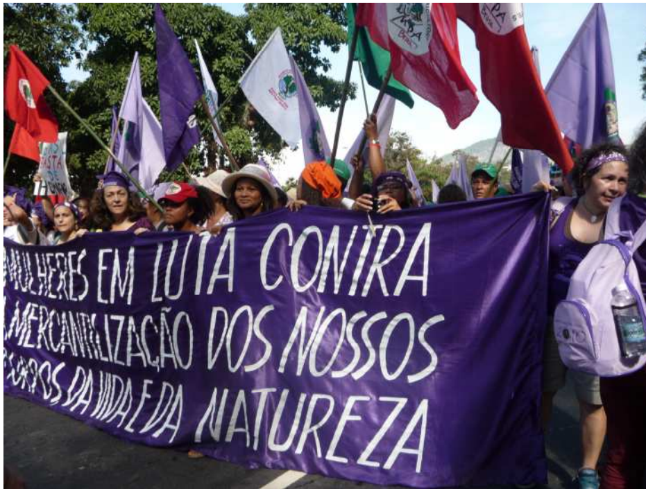
Women protesting against the commercialization of life at the Rio+20 Summit.