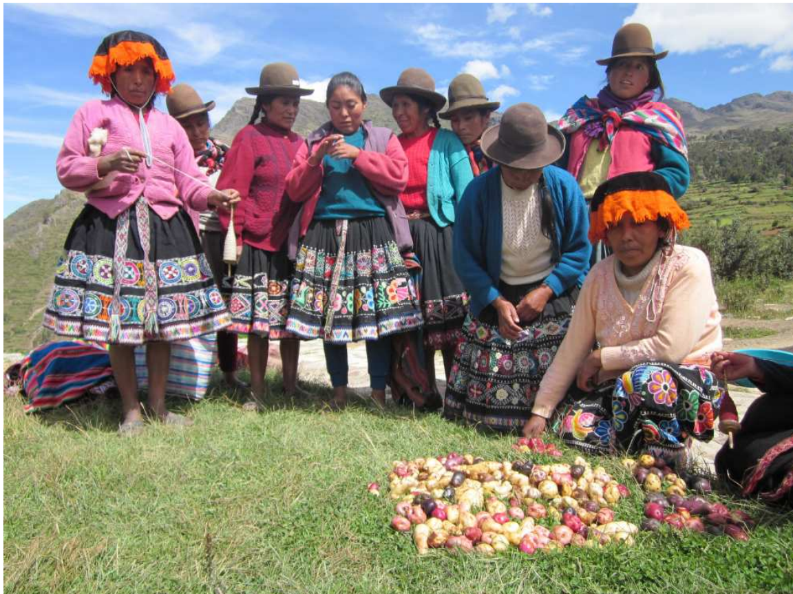
Integrate gender-sensitive solutions to climate change and facilitate women's equitable participation in decision-making processes at all levels. See also: http://ipcca.info

UNCSD Secretariat, 2012. Current Ideas on Sustainable Development Goals and Indicators RIO 2012 Issues Briefs Produced by the UNCSD Secretariat No. 6 In: https://docs.google.com/gview?url=http://sustainabledevelopment.un.org/content/documents/327brief6.pdf&embedded=true