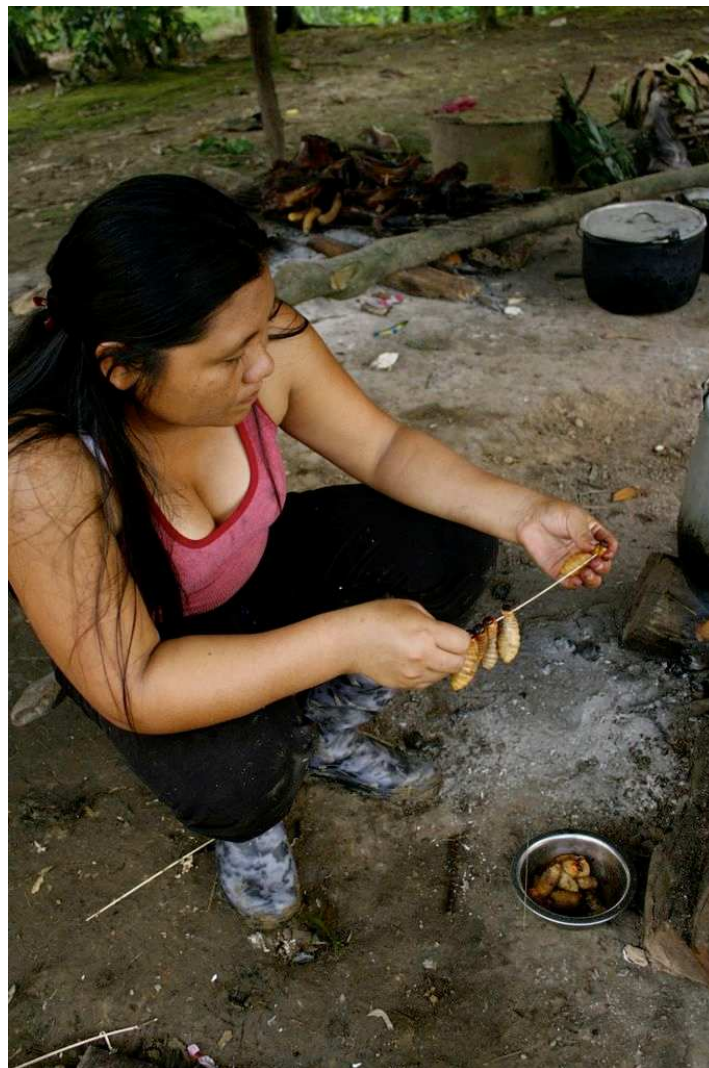
Sapara woman. Ecuador. Photo: Indigenous Peoples Biocultural Climate Change Initiative. See http://ipcca.info

Effective governance and respect for women's rights are key prerequisites that enable women to engage in these processes. A serious shift towards sustainable development requires gender equality and an end to persistent discrimination against women at all levels of biodiversity and cultural resources use.