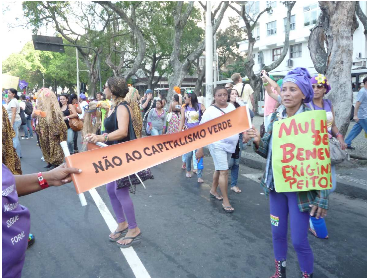
Women's March at Rio+20.

predict with certainty which commodities or workers will be affected and how quickly. However, if a new nano-engineered material or a new bioproduct created using synthetic biology equals or outperforms a conventional commodity and can be produced at a comparable cost, it is likely to replace the conventional commodity. Modern history is replete with examples of new technological products and processes replacing traditional commodities, causing massive displacements in livelihood and employment. 314