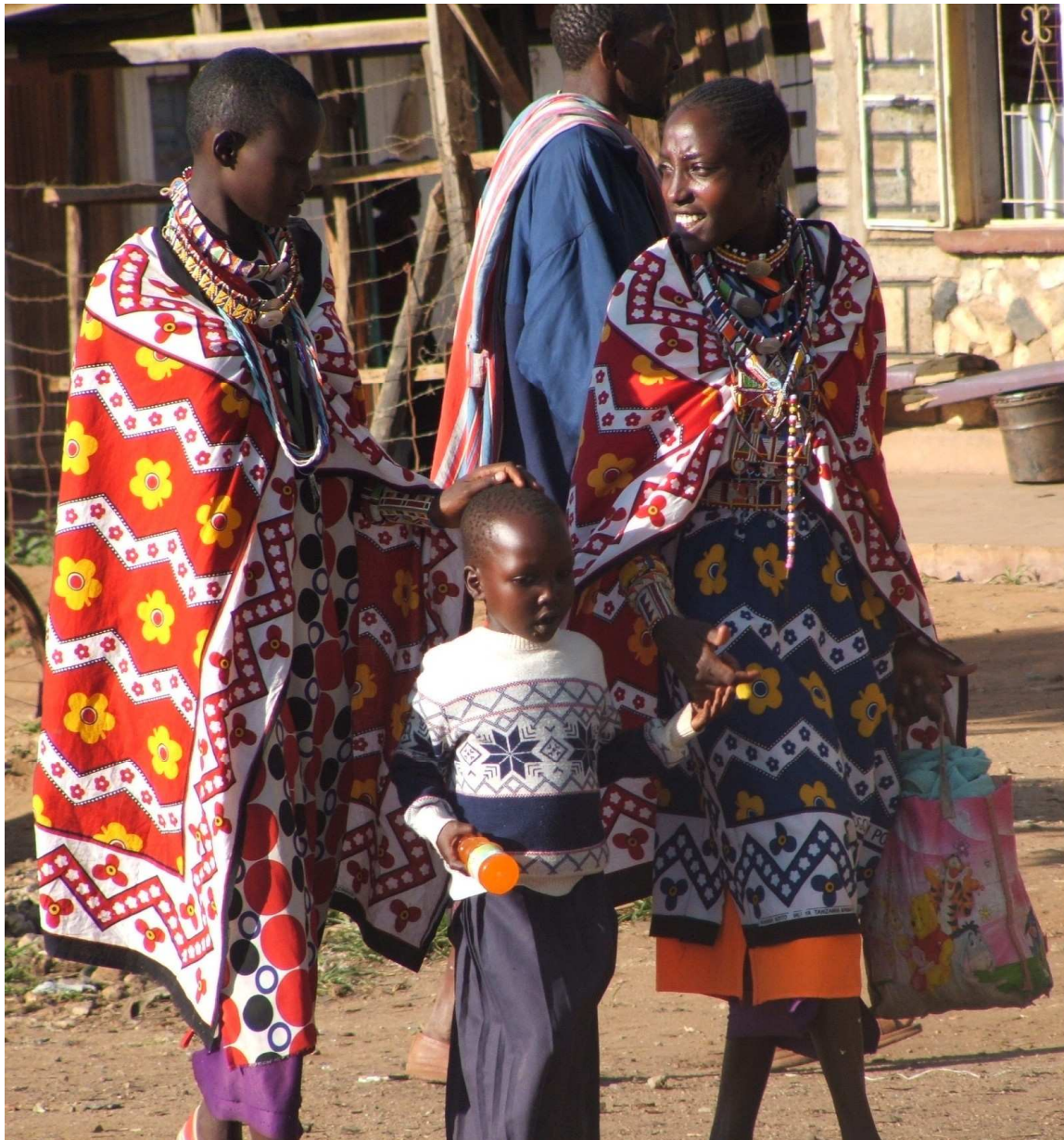
Maasai women, Kenya.

Opposition to technology evaluation can be expected from some industries and governments. Arguments against undertaking technology assessments historically revolve around protestations that the assessments are premature – or, alternatively, too late – are too costly, or are not worth the potential delay in commercial deployment or risk to competitive advantage. 342 However, there is reluctant recognition from many parties, and within the UN, that ‘business as usual’ is not working. In the absence of any technology assessment mechanism to deal with intergovernmental concerns and transboundary issues, the UN has had no structural alternative but to adopt three moratoria related to new technologies since the beginning of the 21 st century, namely, on GURTs (genetic use restriction technologies, or Terminator seeds) in 2000; on ocean fertilization in 2008; and a general moratorium on climate-related geoengineering in 2010, which was reaffirmed in 2012 – all under the aegis of the Convention on Biological Diversity (CBD).