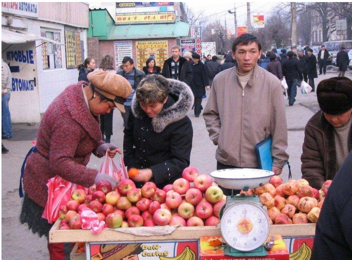
All children, women and men should have access to safe, regional, diverse and affordable food, free of hazardous chemicals and GMOs, based on fair trade and produced in harmony with nature and landscape, protecting water, soil, air and biodiversity.

In an increasingly globalised world, the impact of trade and investment liberalisation is an important area of policy focus. In the current context, the gender impact of trade policy must be paid serious attention especially as it is increasingly evident that trade policy is not 'gender neutral'. This is because women's economic and social positions are weaker, their rights are not well defined and a harshly competitive system hurts the weakest the most. The impact on women is partly general 273 and partly gender specific, determined by the way they are integrated into specific sectors.