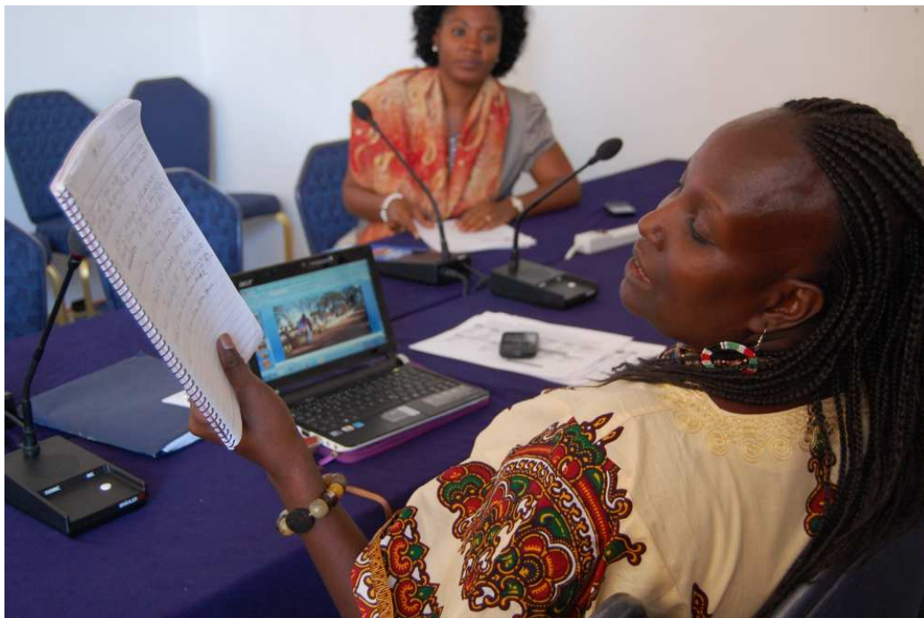
Women delegates to the UNFCCC in a learning exchange, Cancun, Mexico, 2010.

Achieving gender equality is intrinsic to the advancement of human rights. Women's rights are human rights and must be respected, promoted and protected by all actors in all sectors. Neither gender equality nor human rights can be separated from sustainable development, which has interlinked social, economic and environmental dimensions. Gender equality is a driver of sustainable development – and sustainable development should be a driver of gender equality.