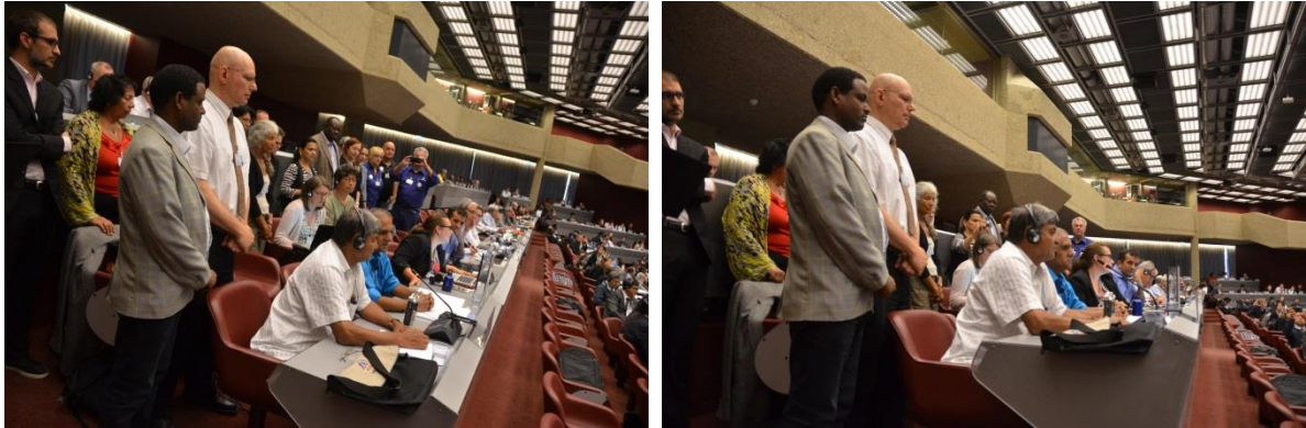
Photo10; after the victim's testimony, delegations began to applaud to encourage the victim who made it clear what Rotterdam Convention and government delegation had to do.