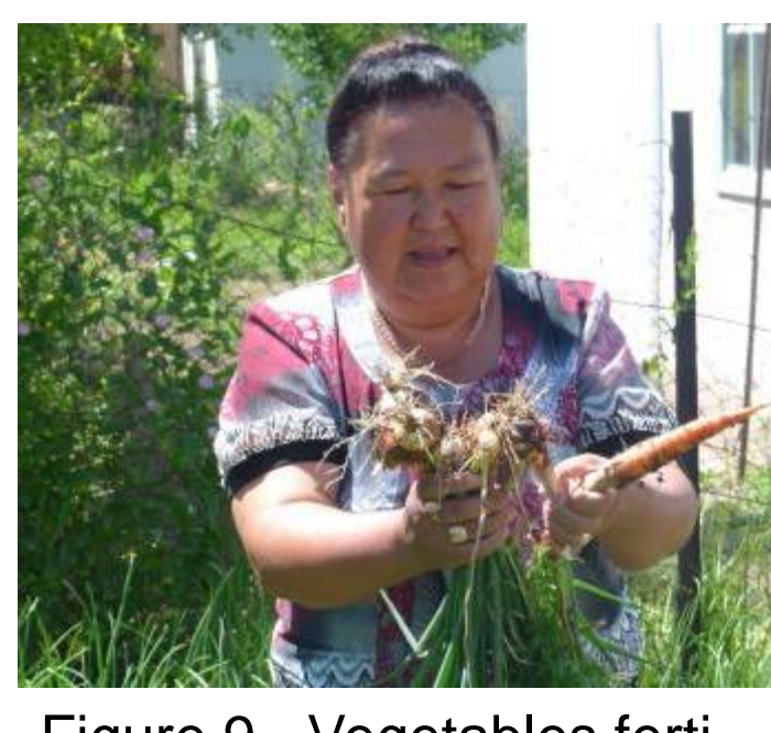
Figure 9 - Vegetables fertilized with UDDT products

Barriers to upscaling include amongst others the need for behavioural change regarding hygiene practices, financial limitations and a relatively low economic pay-off in case of the UDDT, cultural norms (e.g. the perception that a shower is inadequate for personal hygiene) and a general indifferent attitude towards innovative technologies. However, regular consultations and trainings, hence the access to knowledge can change the attitude and cultural norms over time.