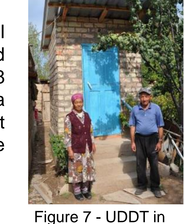
Issyk Kul oblast

Villagers recognised the importance of investments in improved rural living standards through sustainable sanitation, however they reported that they faced the problem of lack of financial resources. Graph 8 presents the willingness of respondents to invest their own money in a UDDT. About 14% respective 31% of the respondents indicated that they would take a low-interest (5%) microcredit for a UDDT respective a SWH.