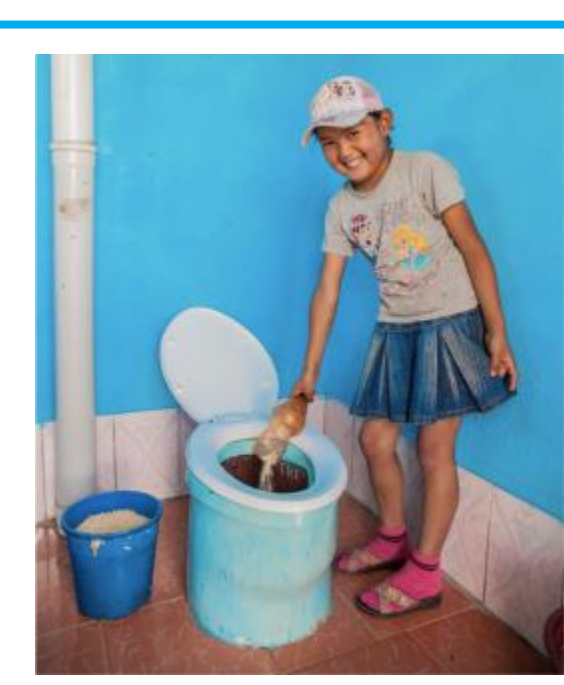
Figure 1 - UDDT

64 % of the population of the Kyrgyz Republic resides in rural areas. Rural inhabitants face many problems in daily life: lack of safe sanitation, limited access to safe drinking water and low nutritional status. Consequently, villagers are confronted to related health issues: waterborne diarrhoeal diseases are the main drivers of child mortality, causing 35 deaths per 100,000 children under five and placing Kyrgyzstan to the bottom of the ranking with regards to this statistic across the pan-European Region [1]. The project Home Comfort has been creating local capacities for improved rural living standards through affordable and sustainable energy and sanitation in Issyk Kul and Naryn oblasts, which belong to the poorest of the country. Introduced technologies included urine diverting dry toilets (UDDT) and solar water heaters (SWH). The technologies were adapted to local conditions and capacity was built for institutions and masters. By means of demonstration centres awareness among the population was raised. The project was supported by the EU and implemented by Women of Europe for Common Future (WECF), Kyrgyz Alliance for Water and Sanitation (KAWS), CAMP Ala-Too (CAMP) and Rural women's association "Alga". The poster investigates the opportunities for upscaling UDDTs and SWHs, especially addressing SDG 5 and 6 [2]. Innovative sustainable technologies using local materials have been introduced in rural Kyrgyzstan during the last 6 years [3].