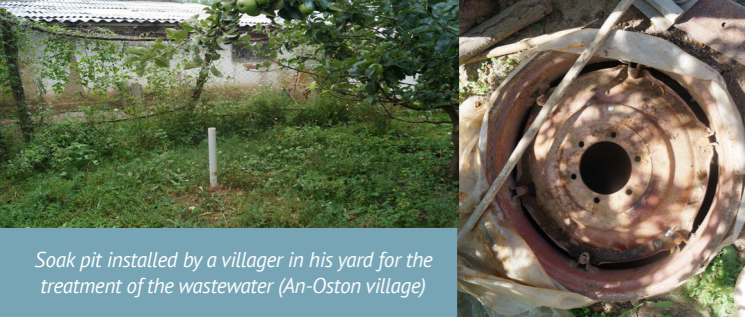
Soak pit installed by a villager in his yard for the treatment of the wastewater (An-Oston village)