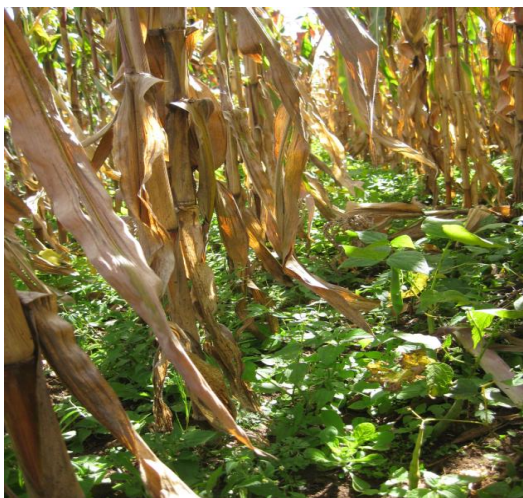
Photo (source Margriet Samwel, WECF): example of mulched maize with an intercrop

It is unwise however, to mix plants belonging to the same family because they are prone to attack by the same microorganisms. Therefore, it is not advisable to mix potato and eggplant, cabbage and cauliflower, cucumber and courgettes. It is safe to mix species from different families like tomato and pigeon pea, cabbage and onion and cucumber and maize. This holds for crop rotation. Plants from same family should not be grown in succession.