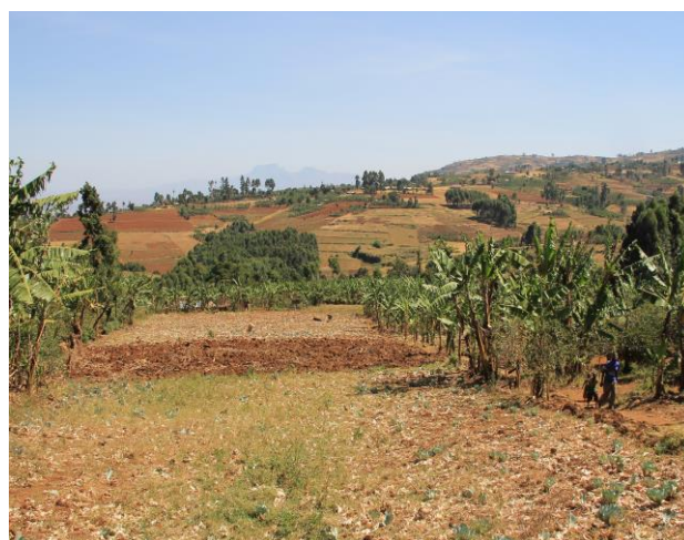
Photo (source Afke Jager WECEF/WUR): example of uncovered soils, thus prone to erosion and lost of nutrients.

The use of non-composted manure is prohibited in organic production. Composted plant or animal materials must be produced through a process that establishes an initial carbon-to-nitrogen (C:N) ratio of between 25:1 and 40:1 and achieves a temperature between 131°F and 170°F. Heat generated during the composting process will kill most weed seeds and pathogens. The microbial mediated composting process will lower the amount of soluble N forms by stabilizing the N in larger organic, humus-like compounds. A disadvantage of composting is that some of the ammonia-N will be lost as a gas. Compost alone also may not be able to supply adequate available nutrients, particularly N, during rapid growth phases of crops with high nutrient demands. The decision on what form of manure to use will ultimately depend on certification requirements, availability, and cost. Composted manure is usually more expensive than fresh or partially aged manure.