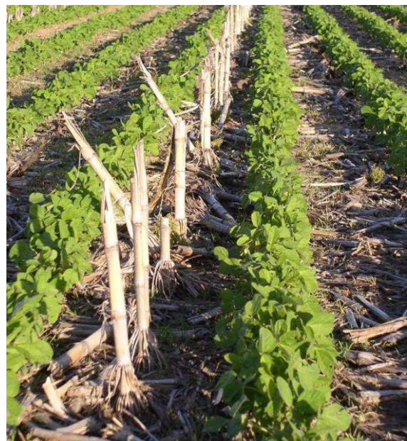
Zero tillage in Argentina

Sowing of appropriate species, or growing spontaneous vegetation, in between rows of crops, trees, or in the period of time in between successive annual crops, as a measure to prevent soil erosion and to control weeds. A cover crop and the resulting mulch or previous crop residue help reduce weed infestation through competition and not allowing weed seeds the light often needed for germination.