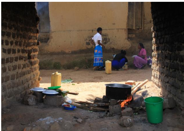
Women spend a greater part of their work hours in non-market activities

for work and equality in access to human capital and other productive resources that enable opportunity), and equality of voice (the ability to influence and contribute to the development process). It stops short of defining gender equality as equality of outcomes for two reasons. First, different cultures and societies can follow different paths in their pursuit of gender equality. Second, equality implies that women and men are free to choose different (or similar) roles and different (or similar) outcomes in accordance with their preferences and goals.