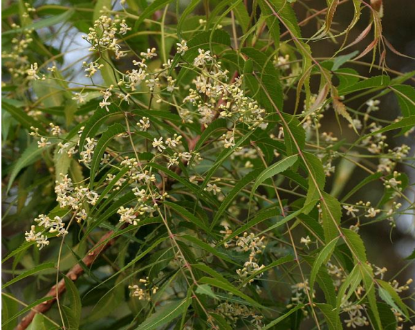
Flowers and leaves of the Neem Tree ( Azadirachta indica ). Almost every part of the tree is useful.