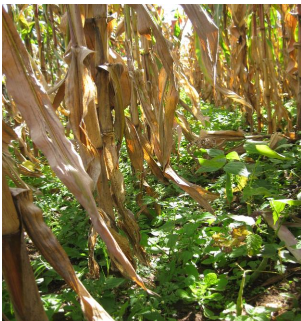
CA maintains a permanent or semi-permanent organic soil cover consisting of a growing crop or dead mulch

Maintaining a permanent soil cover also enhances water infiltration, improves soil water use efficiency, and provides for increased insurance against drought. Permanent soil cover can be maintained during crop growth phases as well as during fallow periods, using cover crops and maintaining residues on the surface. Examples of cover crops include the velvet bean, Jack beans, sunn hemp.