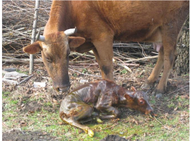
new born calf – choice of resistant breeds, balanced nutrition, good hygiene and sanitation are some conditions for a healthy animal husbandry