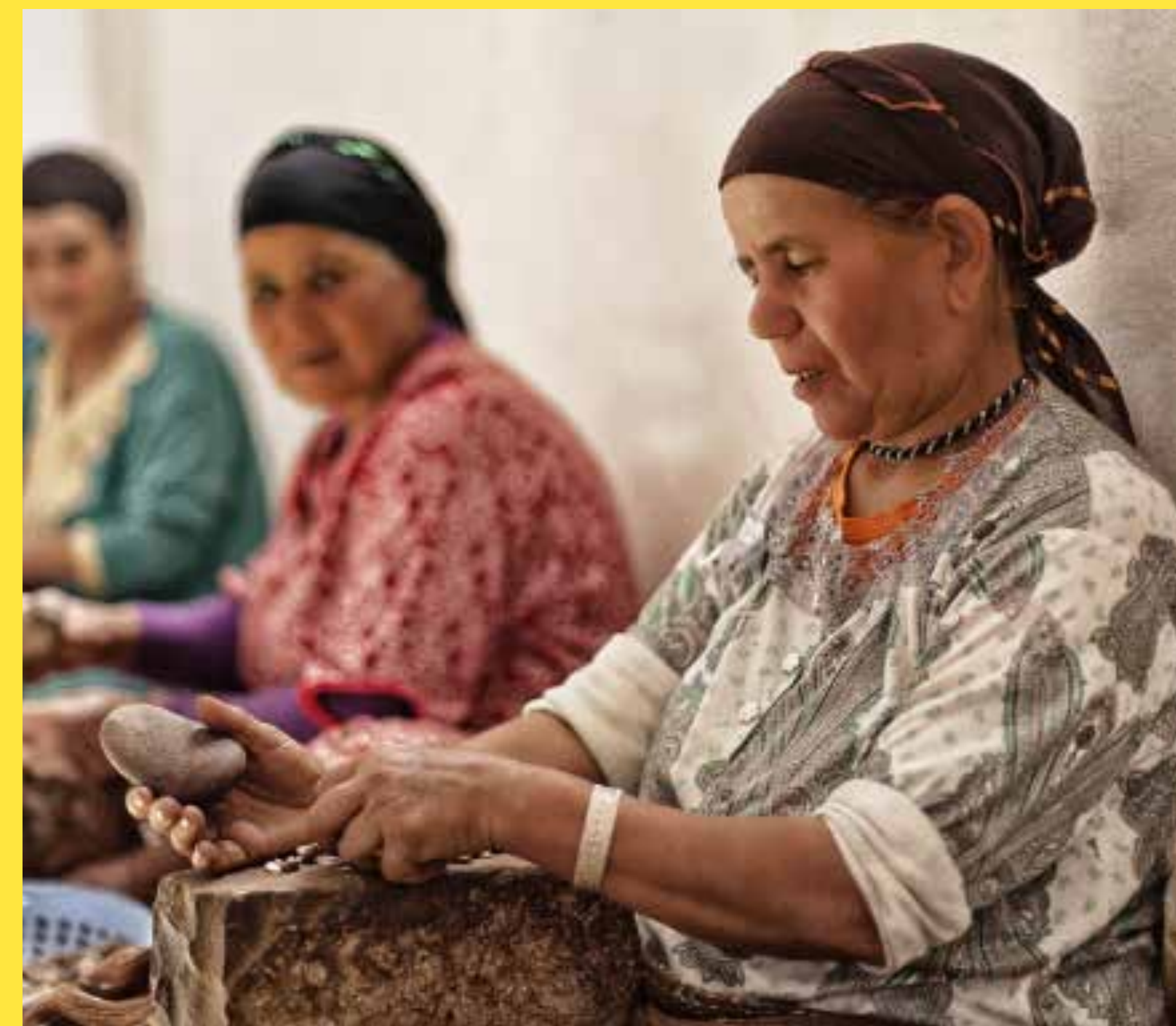
Argan oil cooperatives ensure financial autonomy for women