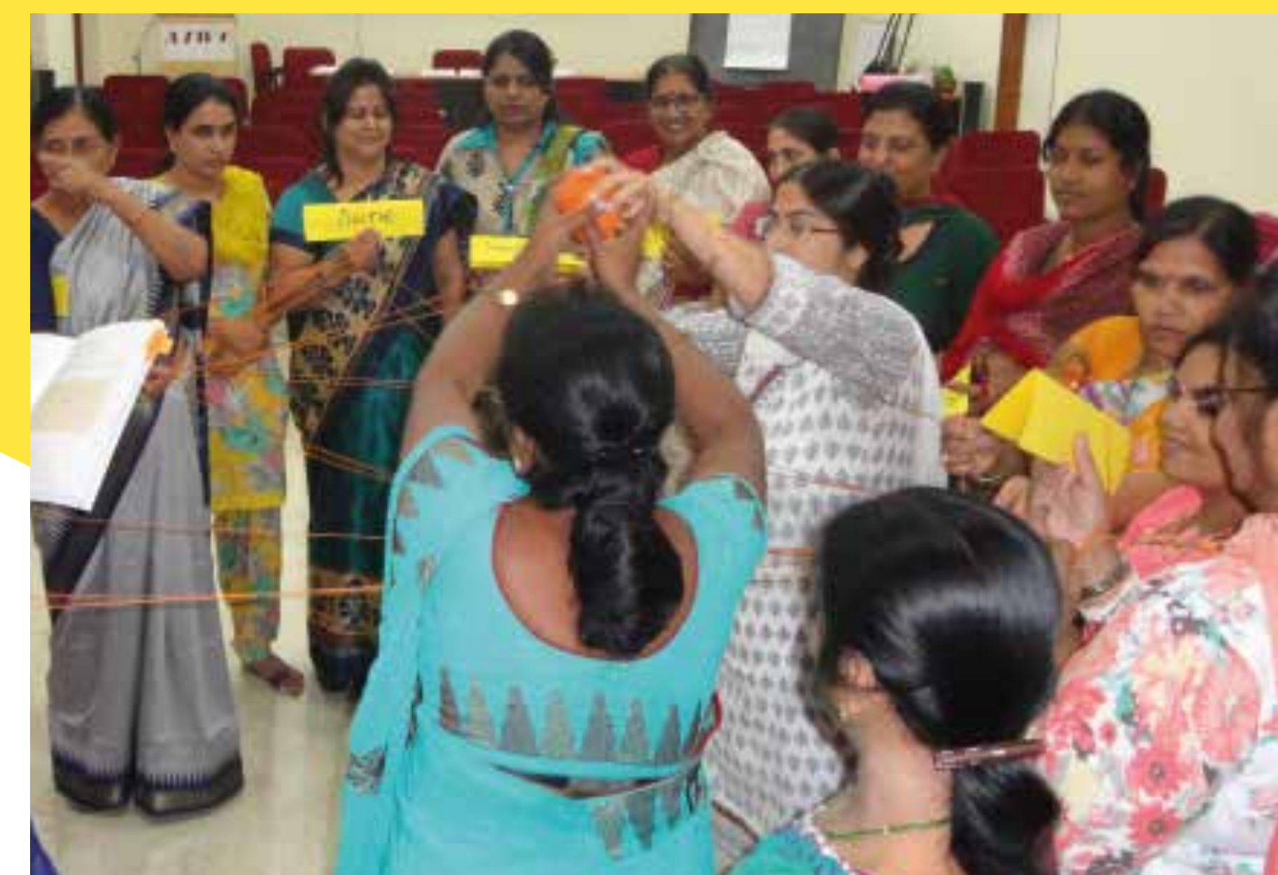
Acting for sexual health and sexual rights of women in India