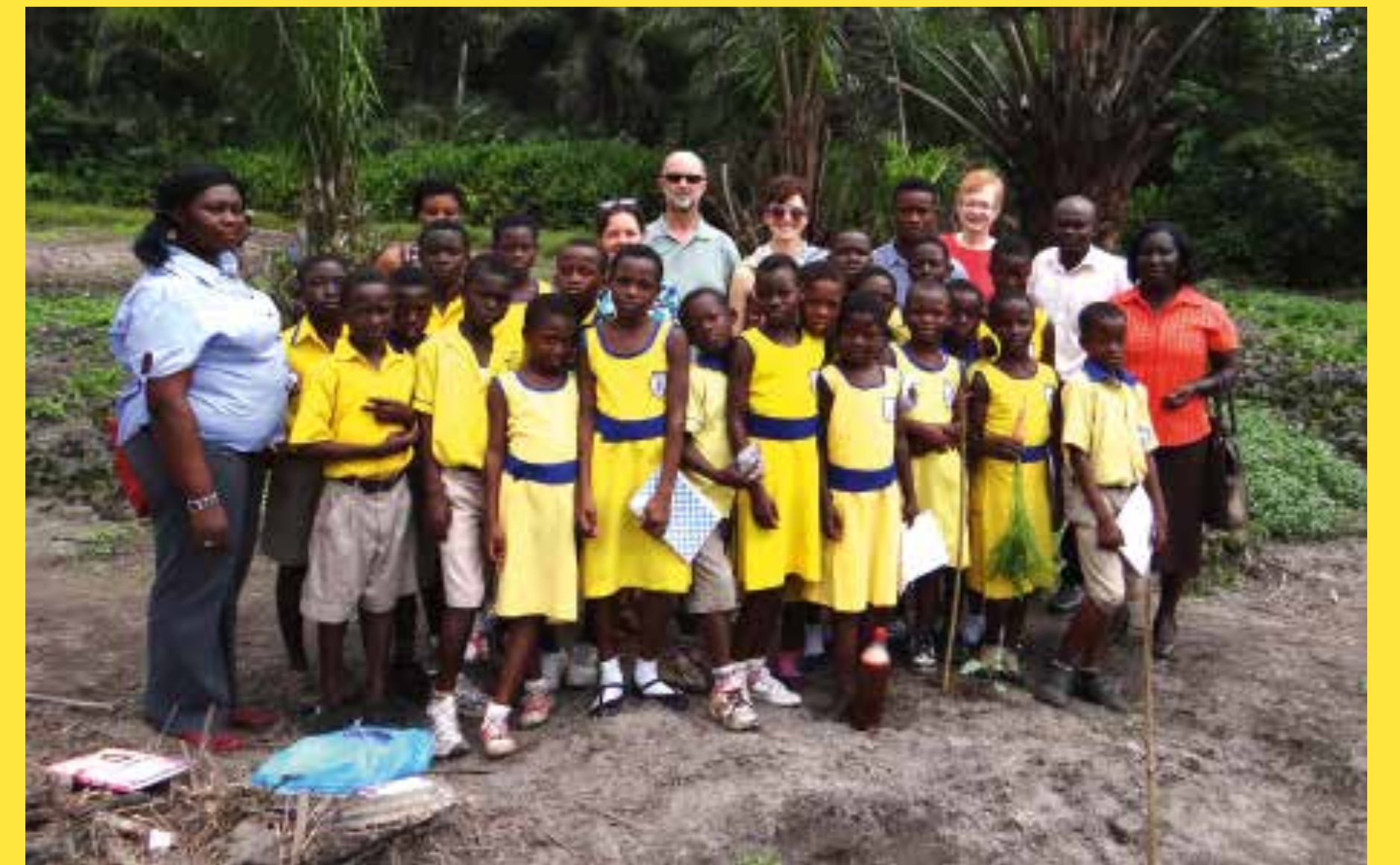
Girls' empowerment program - Africa