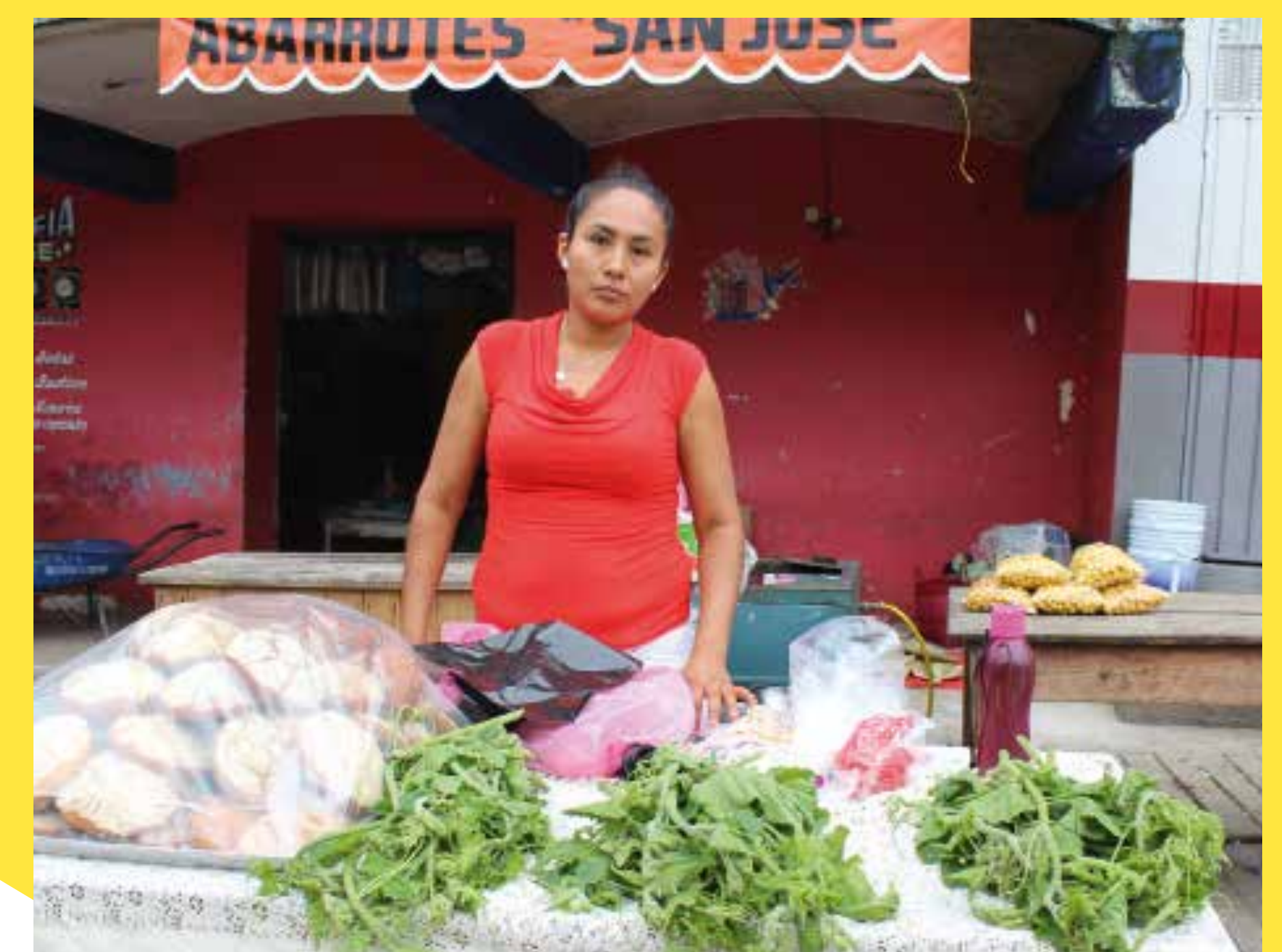
Woman on local market – Latin America